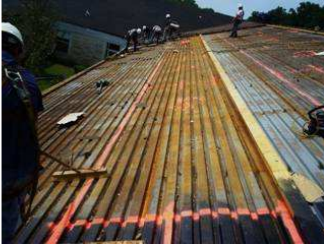
General Overview A