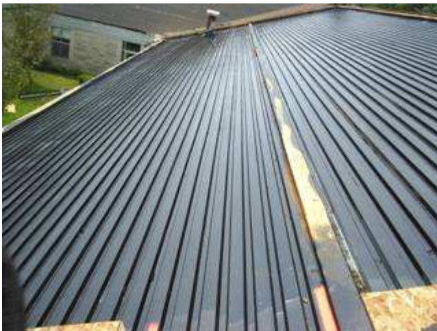
Paint Overview C